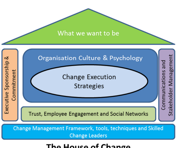
The House of Change

leaders to be used during the change process. The skilled change leaders must be familiar with the frameworks, tools and techniques available in order to use the appropriate ones given a particular circumstance. There is no silver bullet, no one technique will be fit for purpose for all scenarios. Such tools include appreciative inquiry, collaborative loops, Balanced Scorecard, Six Sigma, Whole Scale Change, etc<sup>7</sup>. Trust, employee engagement and social networks form the floor of the house and addresses social theory; this gives us firm grounding to walk on and utilises the organisational social strengths and intellectual capital in designing and developing employee-led change.