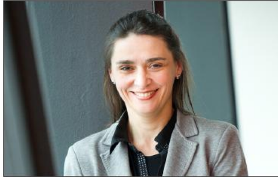
Professor Erika Ábrahám (RWTH Aachen University)

The satisfiability problem is the problem of deciding whether a logical formula is satisfiable. For first-order arithmetic theories, in the early 20th century some novel solutions in form of decision procedures were developed in the area of Mathematical Logic. With the advent of powerful computer architectures, a new research line of Symbolic Computation started to develop practically feasible implementations of such decision procedures.