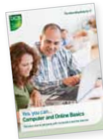
Promotional leaflet and poster

Computer and Online Basics comes from the respected ECDL Foundation and can easily be the first step to a higher qualification.