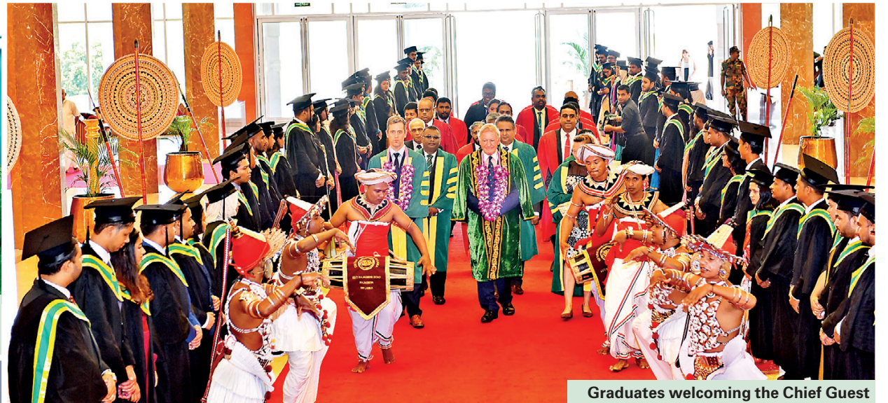
Graduates welcoming the Chief Guest