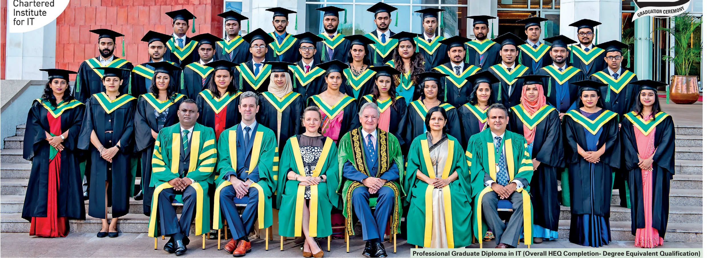
Professional Graduate Diploma in IT (Overall HEQ Completion- Degree Equivalent Qualification)

B ritish Computer Society (BCS) The Chartered Institute for IT Sri Lanka celebrated its 20th Graduation Ceremony and academic achievements on Tuesday 15th October 2019 at the BMICH where 488 received certificates and awards for BCS Higher Education qualifications for the year 2018/2019.