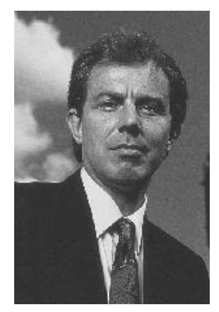
Blair: Denies all knowledge of IRSG