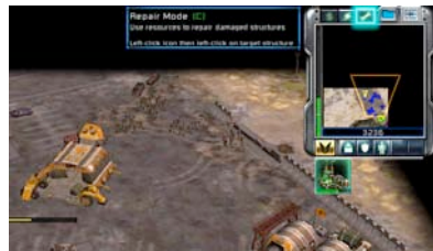
Figure 5. "Fog of War". It is not possible to see unless it is at units' sight.

The classical perspective used in RTS games is isometric, also known as 2.5D, because it is a 2D representation of objects but with some resemblance to 3D. The degrees of freedom are four: left, right, top, bottom. A fifth liberty is not really utilized, although there are flying and ground units, vertical direction is not allowed. The camera is fixed, but it is possible to zoom in and out. The navigation metaphor in this case is world-in-hand with 4 degrees of freedom.