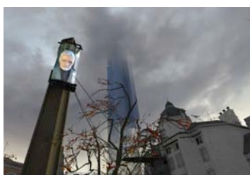
Figure 4. Combine citadel.

The player has to move in a 3D world (“City 17”) and in this game there is no mini-map provided. Hence, constrained paths and landmarks are used for easing navigation. For example, the Combine Citadel is easily spotted, that tower is so high that reaches the clouds; this giant structure helps users get their bearings (see figure 4). Since there is no map to read, wayfinding is the option given to players to construct a representation of this 3D environment [8, 11]. There are three steps: first, ‘declarative knowledge’ is to provide a landmark that will be recognized: Combine Citadel. Then, a ‘procedural knowledge’ will be developed by the player who will construct routes and learn how to get to different locations using landmarks as key information. Finally, a ‘cognitive spatial map’ will be built.