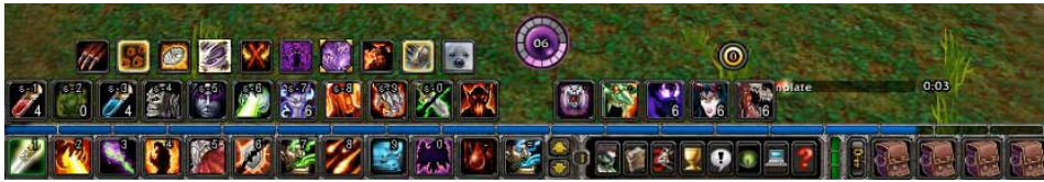
Figure 14. Customized Action Bar and Add-ons

In WoW the mini-map is by default north-up oriented. There are techniques developed by Saito and Takahashi [11] used in this mini-map: shaded image, and profile image. Applying such techniques helps to show the terrain effectively. In this mini-map it is allowed to zoom in, and out. Arrowed-dots, a visual grammar code, are used in the mini-map to point to cities and party members. Our location is always in the middle of the mini-map, represented by an arrow heading to where we are facing; this last feature is one of the ways to enhance visualization with maps suggested by Ware. See figure 15.