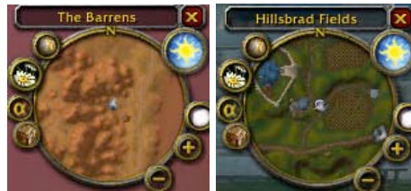
Figure 15. Mini-maps in WoW

In WoW the mini-map is by default north-up oriented. There are techniques developed by Saito and Takahashi [11] used in this mini-map: shaded image, and profile image. Applying such techniques helps to show the terrain effectively. In this mini-map it is allowed to zoom in, and out. Arrowed-dots, a visual grammar code, are used in the mini-map to point to cities and party members. Our location is always in the middle of the mini-map, represented by an arrow heading to where we are facing; this last feature is one of the ways to enhance visualization with maps suggested by Ware. See figure 15.