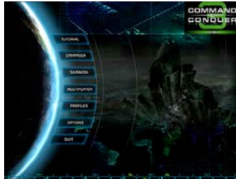
Figure 9. Edge Enhancement technique is applied in the main menu of C&C 3

In the main menu of C&C3, the Edge Enhancement technique is applied. Like artists such as Seurat have used it [11], its purposes are to display objects clearly, and enhance a certain part, in this case the menu where the options are, by an edge produced through shading out the two sides. See figure 9.