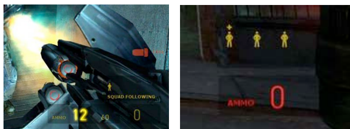
Figure 3 A. Left, HL2. Bullet silhouette for indicating that reloading is necessary. Figure 3 B. Right, Player has run out of ammunition.

The player has to move in a 3D world (“City 17”) and in this game there is no mini-map provided. Hence, constrained paths and landmarks are used for easing navigation. For example, the Combine Citadel is easily spotted, that tower is so high that reaches the clouds; this giant structure helps users get their bearings (see figure 4). Since there is no map to read, wayfinding is the option given to players to construct a representation of this 3D environment [8, 11]. There are three steps: first, ‘declarative knowledge’ is to provide a landmark that will be recognized: Combine Citadel. Then, a ‘procedural knowledge’ will be developed by the player who will construct routes and learn how to get to different locations using landmarks as key information. Finally, a ‘cognitive spatial map’ will be built.