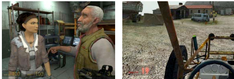
Figure 2 A (Left). Health, and armor (suit) are displayed on the bottom left of the screen Figure 2 B (Right). Player's health is very low. She might die if hit.

Health is critical information for the player, it determines how much room for mistakes is left. If the player runs out of health, the game is over, and she has to start again. Knowing the health status will help her to decide a strategy, for instance to keep moving but in a stealthy way, or looking for some medical kit to increase health. These decisions radically change the game experience. Changes in health status have to be shown all the time. In this game full health is represented by 100 (see figure 2 A). When health decreases and is dangerously low, color-code changes from its regular color into red. This color-coded technique corresponds to established conventions, meaning red danger for western cultures [11]. See figure 2 B.