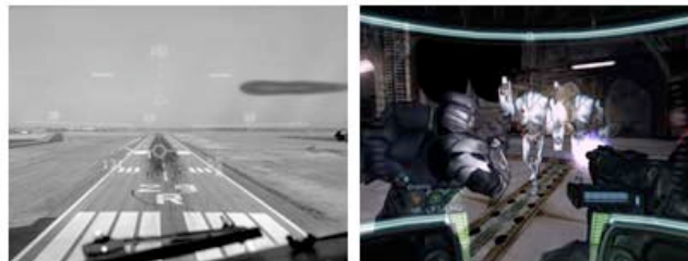
Figure 1 A. On the left, view using a HUD in a Boeing 727.

This is the term employed for referring to a method for game interface. Its main characteristic is that it uses transparencies to avoid obstructing what is happening. It takes its name from HUDs used in real life, such as in aircraft (figure 1 A). This term is used indiscriminately for referring to the permanent type of information given to the player, for example: health status, available weapons, armor, resources, among others. It varies radically depending on the game genre. For getting a better immersion, HUDs are designed to match the game world context, like in Stars Wars: Republic Commando , the HUD is presented as the avatar helmet (figure 1 B). Nowadays, there is a trend in the game industry to have minimalist HUDs, with as little information as possible [6, 12].