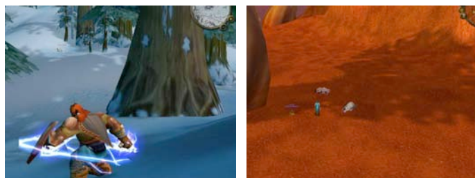
Figure 13. Space perception. Occlusion and shadows

MMO game worlds are crowded ones. There are loads of objects, and gamers should be able to move without inconveniences. The point of view (POV) is an exocentric perspective; player can see his avatar from all sides, the most common camera angle being from behind and above the avatar. Moving around this 3D virtual world is connected with the “walking” navigation metaphor; the computer keyboard and mouse are the input devices. For navigating smoothly in 3D virtual worlds, it is necessary to provide data for an accurate space perception. Two techniques are: occlusion, and cast shadows [11]. Occlusion happens when an object overlaps another, the first one is perceived closer than the last one. However, it is not possible to specify the distance between the two objects. Cast shadows are helpful for providing information about the height of objects. See figure 13.