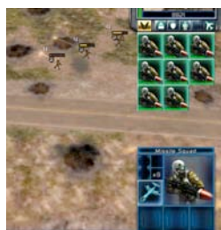
Figure 8. Levels of detail

Technique for levels of detail of the information visualized has three levels [9]. In C&C3 these are: one includes all the units of interest, another level shows information about a subset of unit, and a third level gives details of single units. This distinction of level is pretty useful in RTSs, because it allows managing in a meta-level, but at the same time to keep track of the different units. For example, the player wants to know what kind of unit she has selected: Missile Squad unit (first level); how many units are available: eight units (second level); what health level these units have: low and medium health status (third level). The possibility of having this information at once allows fast decision making. (See figure 8)