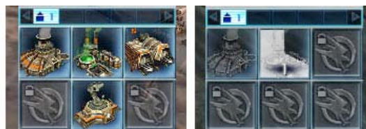
Figure 6. Pre-attentive processing. Colored buttons stand-out, grayed-out do not.

Action button is the industry term for the button that causes an event, for example producing a new unit. This kind of button is depicted by an icon that represents its function, and when the cursor is over the button it will display a description of the event, such as specifying how much of a resource the new unit will cost, and what specifications this unit has. These buttons are not always able to be used, sometimes a tech-tree has to be developed in order unlock action buttons, or more resources are needed. This "momentary" disabled state of the button is related to pre-attentive processing, a theoretical mechanism that allows users to identify symbols in a glimpse. By using colored and grayed-out buttons it is faster to "see" the available options offered. Colored buttons "pop out", while grayed-out ones remain as background. (see figure 6)