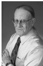
Vernon Smith Economist Nobelprize