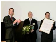
Kings Cross of the Corporate Sector, Denmark