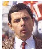
Mr Bean Film character