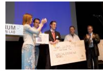
Initiative Prize 2005 IT Forum Midjylland