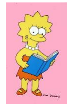
Lisa Simpson Cartoon Figure